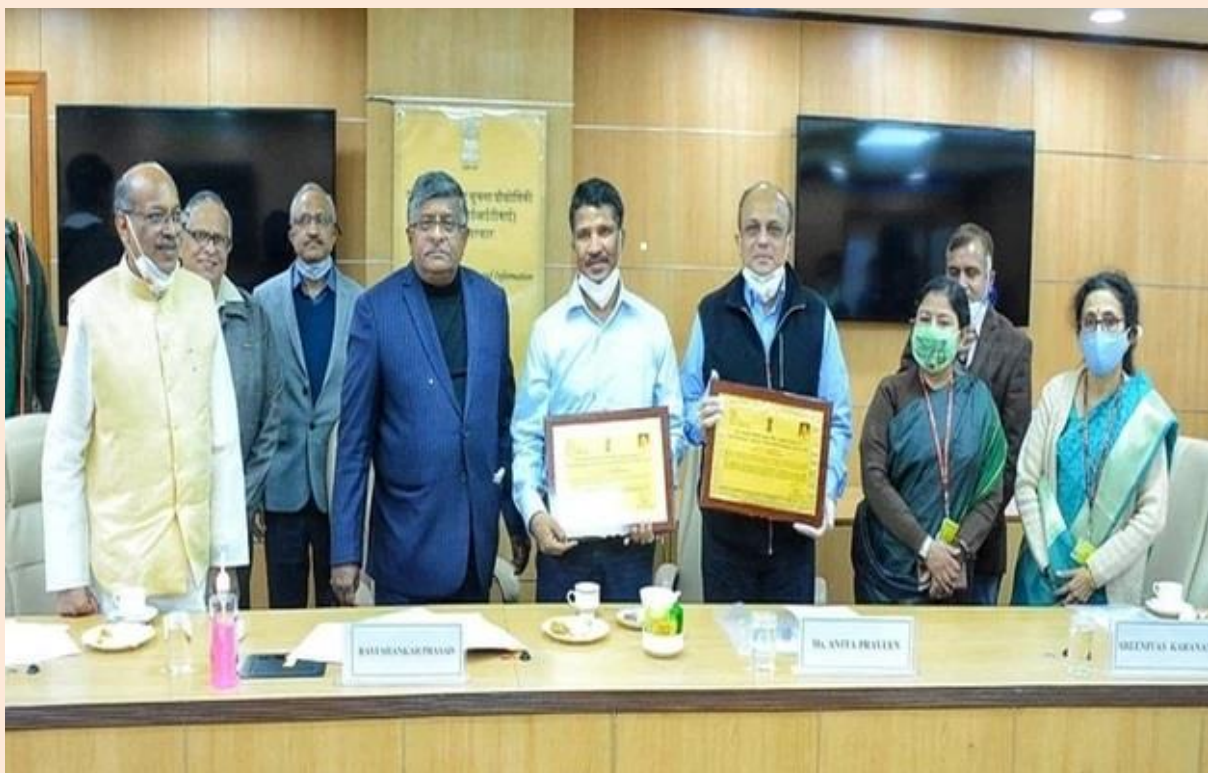
IIT Delhi's Professor Wins Pandit Deendayal Upadhyay Telecom Award 2018